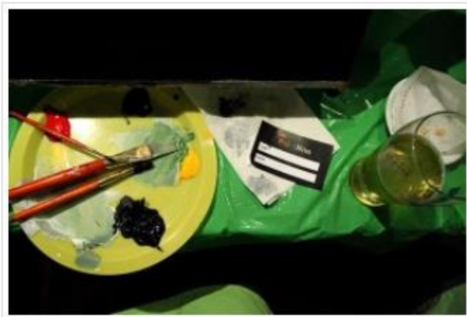
The end of Paint Nite