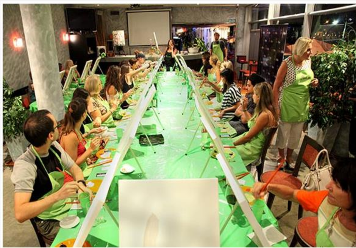
At Simone Bar about to start the Paint Nite event

During a night out in Buenos Aires, you generally don't have to worry about accidentally dipping a paint-covered brush in your glass of beer, or mistaking murky paint water for a cup of Malbec. But at Paint Nite events in Buenos Aires, participants are provided with an apron, canvas, painting materials, and expert artistic guidance while buying drinks and creating a masterpiece.