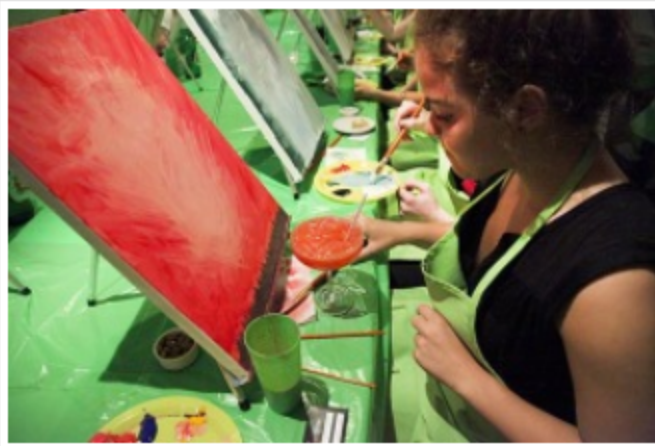
The paintings even matched the cocktails

Using the painting 'Circles and Stems' as a model, Monica guided our group of 25 budding artists through the process of mixing of primary colours, creating the illusion of a lighted a background, and ensuring continuity on our canvases. She circulated throughout the room, guiding us with her knowledge and experience, but also gave us the freedom to interpret for ourselves. "Those colourful balls can be flowers, joyful spirits of the night, or if you want to think outside of the box, go for it!" Some of our painting mates had different ideas: "sperm!" shouted one enthusiastic participant.