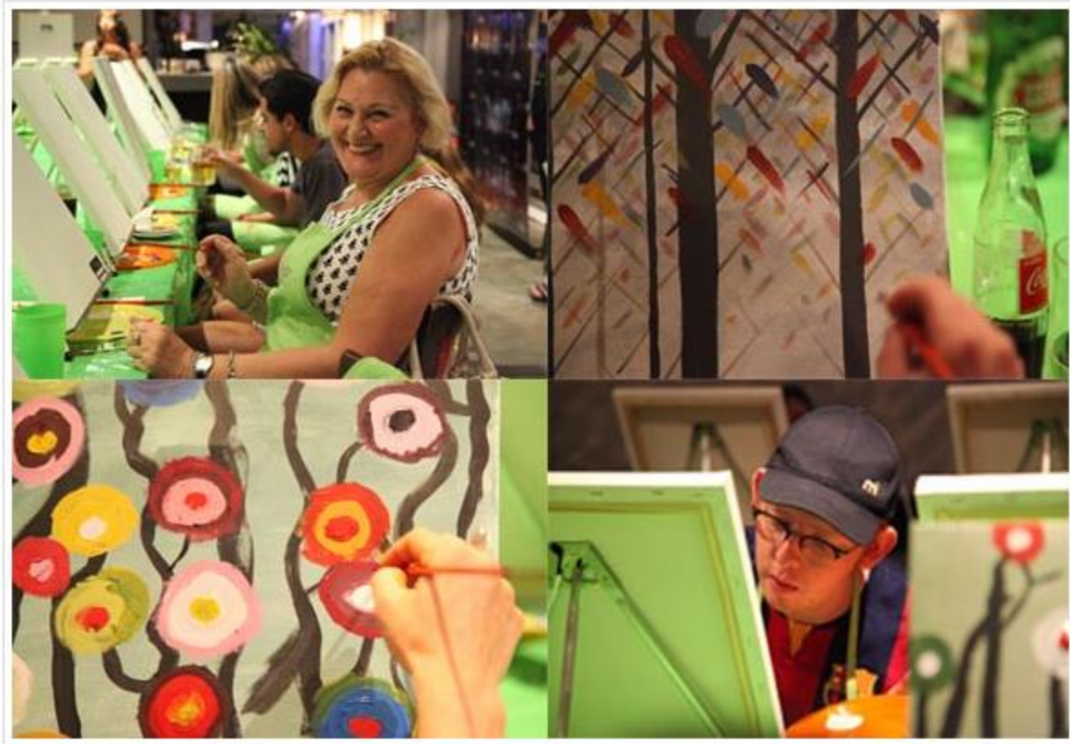
Paint Nite attendees enjoying themselves while painting.