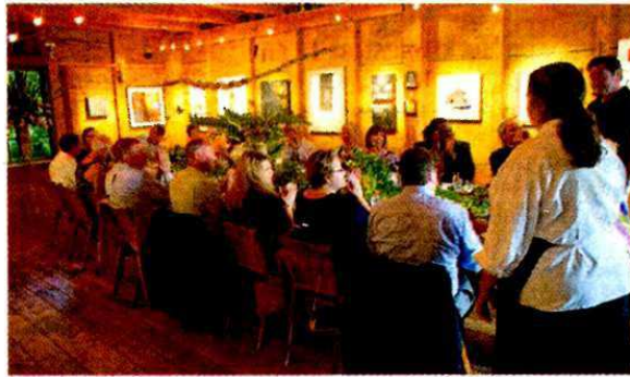
FEAST AT FEST: Kennebunkport diners take part in the Art of Dining event. The Kennebunkport Inn, below, is one of the hotels offering special package deals.