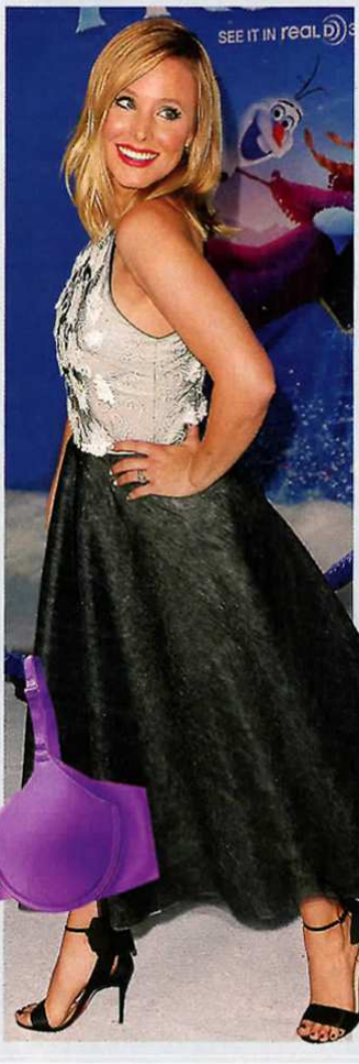
Warner's No Side Effects bra, $38, kohls.com

That unsightly bulge between the bra and underarm known as "sleeavage" or "underarm muffin top" can ruin an outfit, even for super-slim celebs. Now any top can look sleek and chic à la Kristen Bell, thanks to Warner's new No Side Effects bra. Extra-wide elastic-free wings smooth lumps and bumps while shaving off inches. So long, bra bulge!