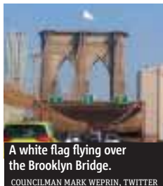
A white flag flying over the Brooklyn Bridge.

The American flags, measuring 20 feet by 11 feet, that had been bleached white flew over the Brooklyn Bridge, leaving police officials