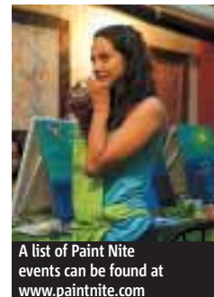
A list of Paint Nite events can be found at www.paintnite.com