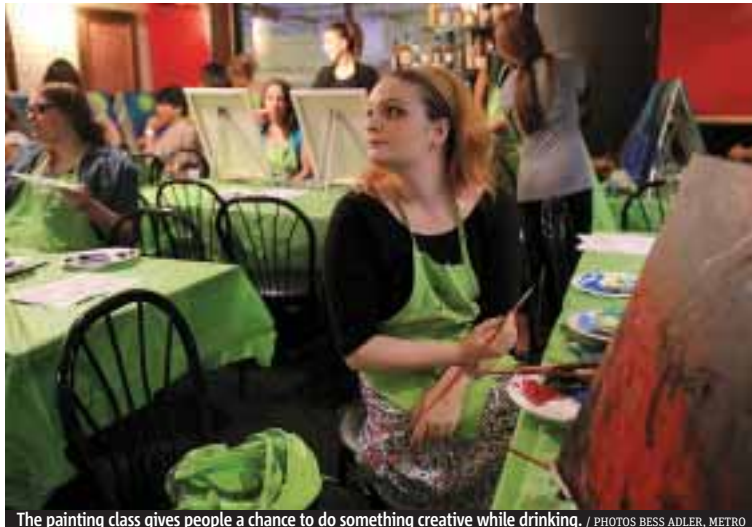
The painting class gives people a chance to do something creative while drinking.