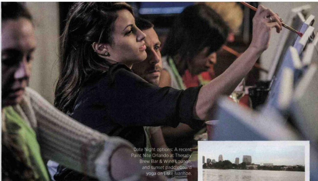
Date Night options: A recent Paint Nite Orlando at Therapy Brew Bar & Wine Lounge, and sunset paddleboard yoga on Lake Ivanhoe.