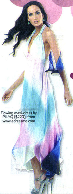
Flowing maxi-dress by PilyQ ($220), from www.edressme.com