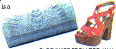
CLOCKWISE FROM TOP: W.H. Petronela crocodile clutch with detachable gold chain strap ($675), available at www.whpetronela.com

"Think tradition, timeless, royalty, and, of course, princess, dutchess, queen and even prime minister," Kay says. "Pastel hosiery is offered in a variety of shades and hues. The colors run the gamut. Think spring flowers, Easter eggs and sorbet. Lace, floral, polka dot, basket weave, crochet patterns are popular."