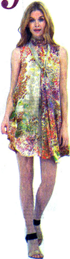
Ali Ro "Olivia" pastel dress ($358), available at www.ali-ro.com