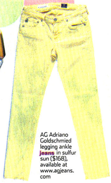
AG Adriano Goldschmied legging ankle jeans in sulfur sun ($168), available at www.agjeans.com