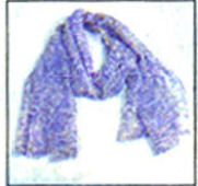
Nepali by TDM's "Zebra" lavender scarf ($105), available at www.tdmdesigninc.com