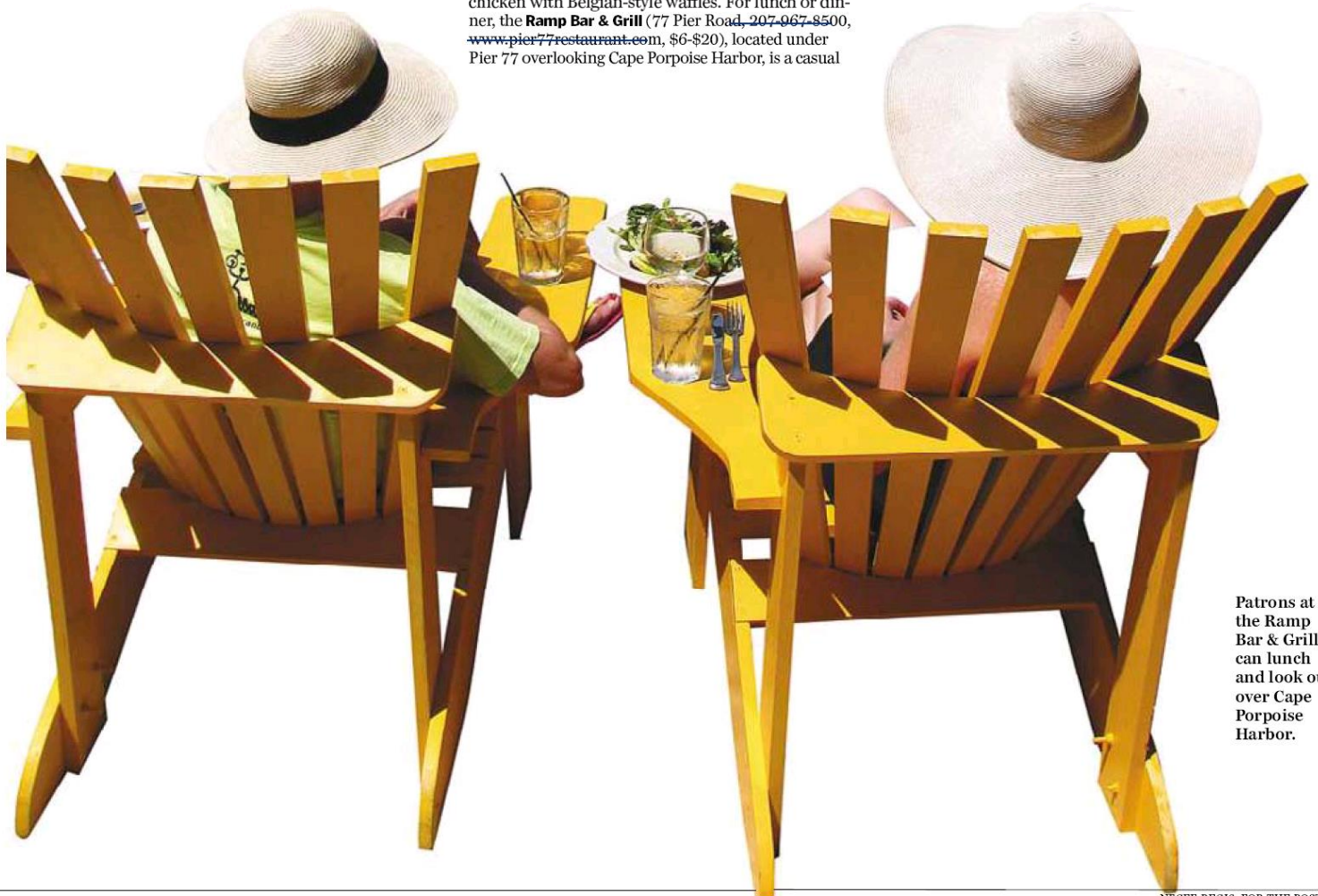
Patrons at the Ramp Bar & Grill can lunch and look out over Cape Porpoise Harbor.