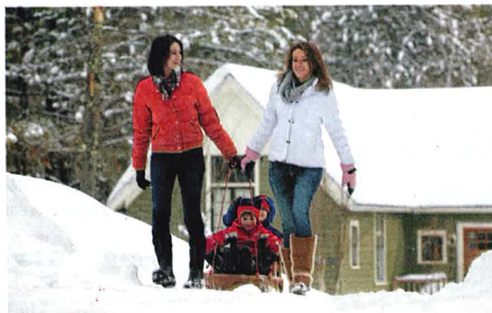
A sled full of children ready to slide in Kennebunkport.