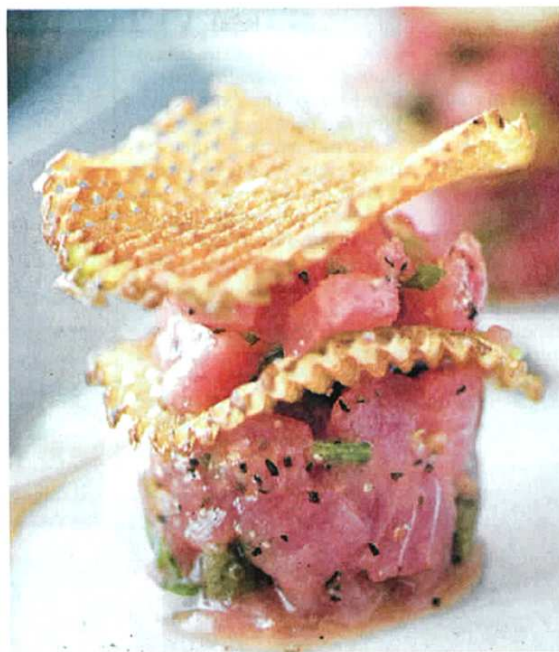
Tuna poke, a raw salad at David's KPT in Kennebunkport.