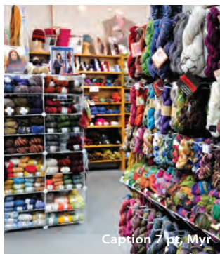
Caption 7 pt, Myr

• Got the bead bug? Feed the need at Lady Bug Beads , where you can find all kinds of baubles for your latest creation from a vast selection that includes cut glass from Czechoslovakia and crystal by Swarovski. Stop by for Tuesday's Bead Happy Hour for help, inspiration or just dedicated time to craft. Open M,W,F 10 am-6 pm; T & Th 10 am-8 pm; Sa 9 am-4 pm; Su noon-4 pm www.ladybugbeads.net . 7616 Big Bend Blvd., 314.644.6140 or 888.30B.EADS. Map 4-5B.