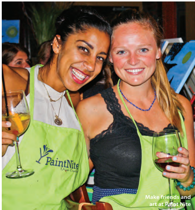
Make friends and art at Paint Nite