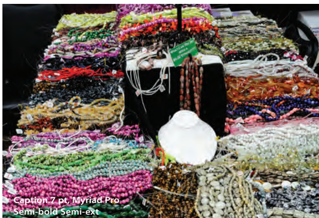
Caption 7 pt, Myriad Pro Semi-bold Semi-ext