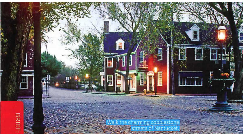
Walk the charming cobblestone streets of Nantucket.