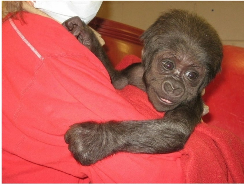
Zoo New England