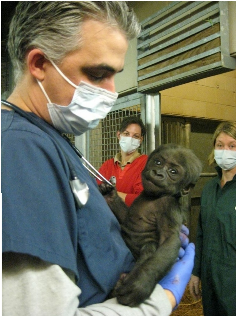
Zoo New England

3. On Kambiri's first doctor's visit, she was all smiles.