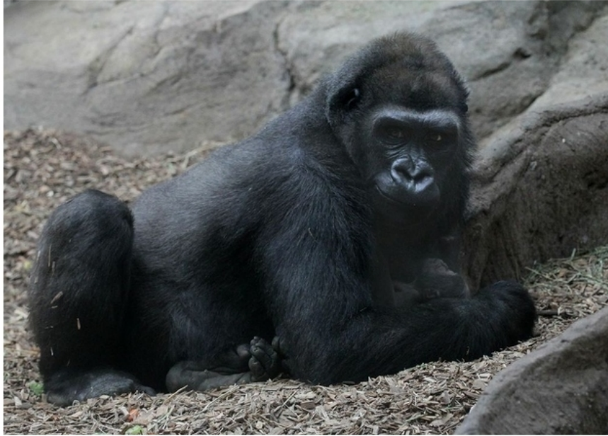
Zoo New England

2. She finally decided on Kambiri and was very excited to make the announcement.