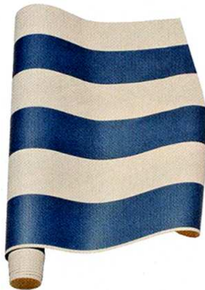
BOLD LINES Wide stripes can be hung horizontally or vertically. William Yeoward for Designers Guild St. Ives Wallpaper in Marine, available to the trade; designersguild.com