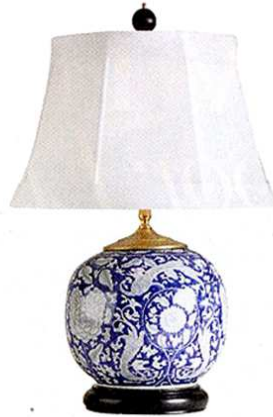
BRIGHT IDEA A simple but elegant shade and brass detailing balance the intricate pattern, making it fab, not fussy. Chelsea House Inc. Scrimshaw Table Lamp , $690; chelseahouseinc.com

BUY IT! Scan this photo to purchase (see page 4)