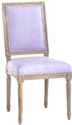
SWEET SEAT Soften your space with a pastel Louis XVI-style dining chair—it looks sophisticated grouped around a table or solo, anchoring a foyer. Wisteria Chateau Dining Chair in Lavender, $299; wisteria.com