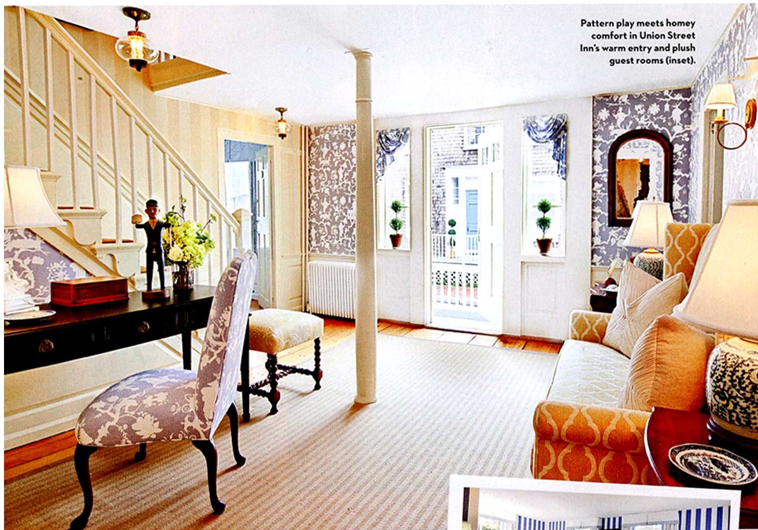
Pattern play meets homey comfort in Union Street Inn's warm entry and plush guest rooms (inset).