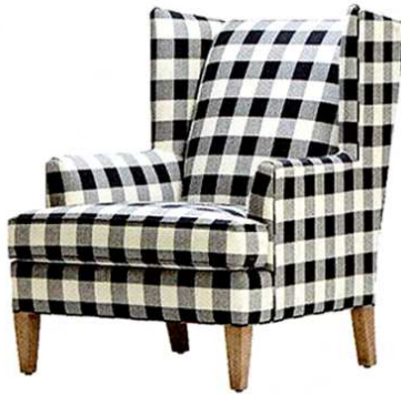
SHOWSTOPPER Upholstered in a bold check fabric, this tight-back chair is gingham gone glam. Ethan Allen Parker Chair in Latte/Montego Black, $1,489; ethanallen.com