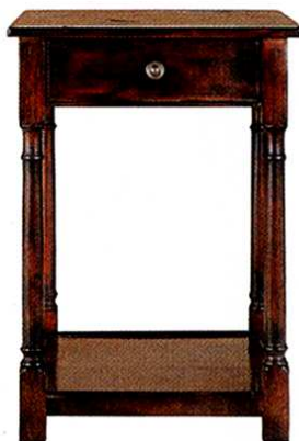
ON THE SIDE Delight in the details: reclaimed wood, a parquet top, a walnut finish, and hand-turned legs. Arhaus Palencia 1-Drawer End Table , $749; arhaus.com