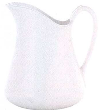
PITCHER PERFECT Fill a porcelain pitcher with bright blooms to channel quintessential New England style. Pillivuyt Pot Mehun Pitcher , $110; williams-sonoma.com