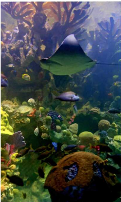
The New England Aquarium houses the Giant Ocean Tank, which is home to more than 2,000 different animals.

Atlanta: Georgia Aquarium ( georgiaaquarium.org ) Miami: Zoo Miami ( miamimetrozoo.com ) Montreal: Space for Life ( montrealspaceforlife.ca ) Nashville: Nashville Zoo ( nashvillezoo.org ) Washington, D.C.: Smithsonian's National Zoo ( nationalzoo.si.edu )