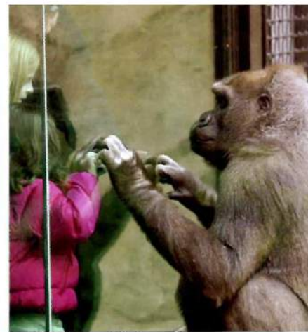
Zip lining at the San Diego Zoo's Safari Park; panda mother Bai Yun and cub Xiao Liwu at the San Diego Zoo; observing gorillas at Boston's Franklin Park Zoo