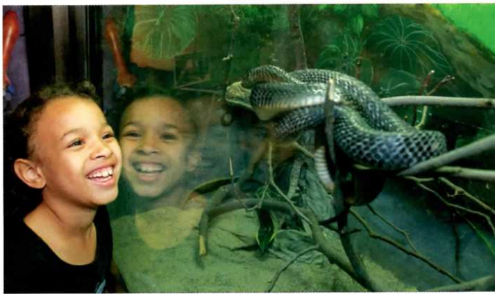
The Philadelphia Zoo's reptile and amphibian house has 47 naturalistic exhibits where families can view snakes, frogs, turtles, crocodiles and more.

The Philadelphia Zoo opened in 1874, giving it the distinction of being the first zoo in the country. Since its