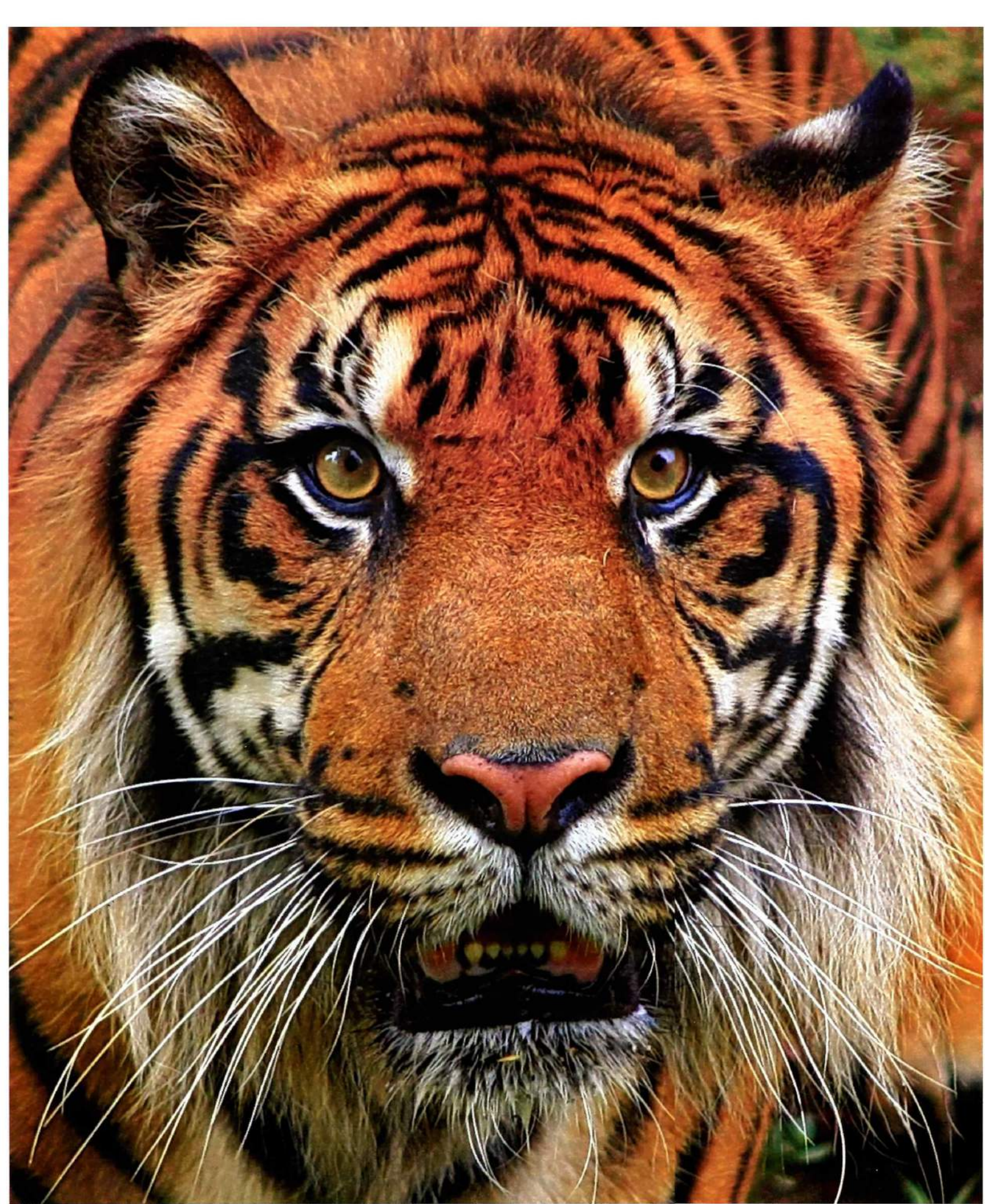
Sumatran tigers are an endangered species from the Indonesian island of Sumatra, but they can be seen at the Los Angeles Zoo.