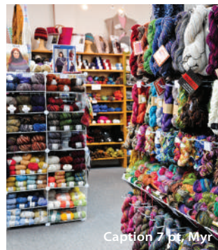
Caption 7 pt, Myr

• Got the bead bug? Feed the need at Lady Bug Beads , where you can find all kinds of baubles for your latest creation from a vast selection that includes cut glass from Czechoslovakia and crystal by Swarovski. Stop by for Tuesday's Bead Happy Hour for help, inspiration or just dedicated time to craft. Open M,W,F 10 am-6 pm; T & Th 10 am-8 pm; Sa 9 am-4 pm; Su noon-4 pm www.ladybugbeads.net . 7616 Big Bend Blvd., 314.644.6140 or 888.308.EADS. Map 4-5B.