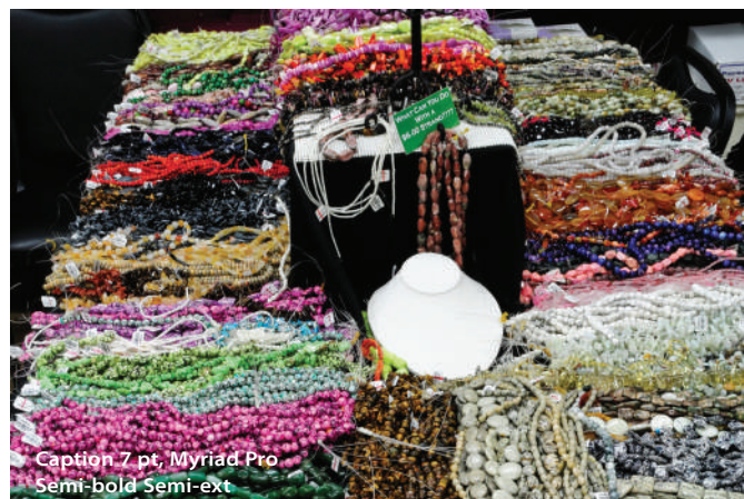
Caption 7 pt, Myriad Pro Semi-bold Semi-ext

(CLOCKWISE FROM ELFT) ©PAINT NITE; ©BROOK NICO; ©D. LANCASTER (2)