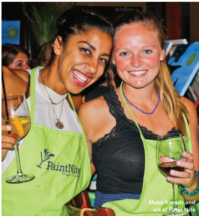
Make friends and art at Paint Nite