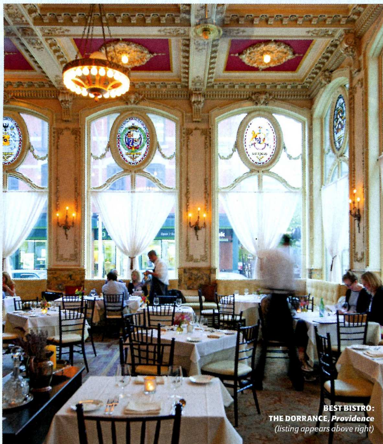
BEST BISTRO: THE DORRANCE, Providence (listing appears above right)

Farmstead shares quarters (and owners) with a great cheese shop, so it's no wonder that the menu features one of Rhode Island's most decadent versions of mac 'n' cheese. Local meats, fish, and produce are also transformed into inventive dishes, such as monkfish served with apple butter and Brussels sprouts. Entrées: from $18. 186 Wayland Ave. 401-274-7177; farmsteadinc.com