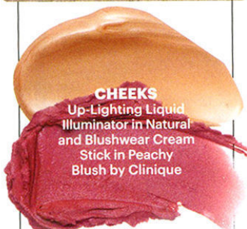
CHEEKS Up-Lighting Liquid Illuminator in Natural and Blushwear Cream Stick in Peachy Blush by Clinique

Colour Surge Eye Shadow Soft Shimmer in Toasted Almond by Clinique