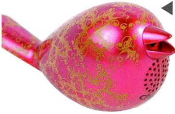
▲ Chicbuds Headphones/Earphones donation: 20% of profits go toward Susan G. Komen Foundation to buy: www.chicbuds.com