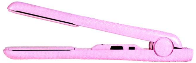
▲ Straight Crazy Flat Iron ($39.99) donation: A portion of the proceeds will be donated to the Susan G. Komen Foundation to buy: www.folica.com

This month we honor the women who have fought or are fighting the battle against breast cancer. All of these products benefit breast cancer awareness by donating part, or in some cases all of the proceeds to various breast cancer organizations.