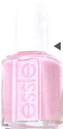
▲ Essie "Raise Awareness" Nail Polish ($8) donation: portion of the sales will be donated to Living Beyond Breast Cancer whose mission is to empower all women affected by breast cancer to live as long as possible with the best quality of life. to buy: ulta.com