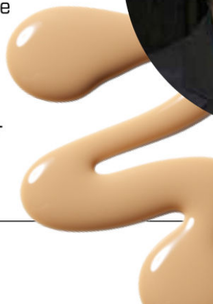
HIPPxRGB Nail Foundation, rgbcosmetics.com , $16