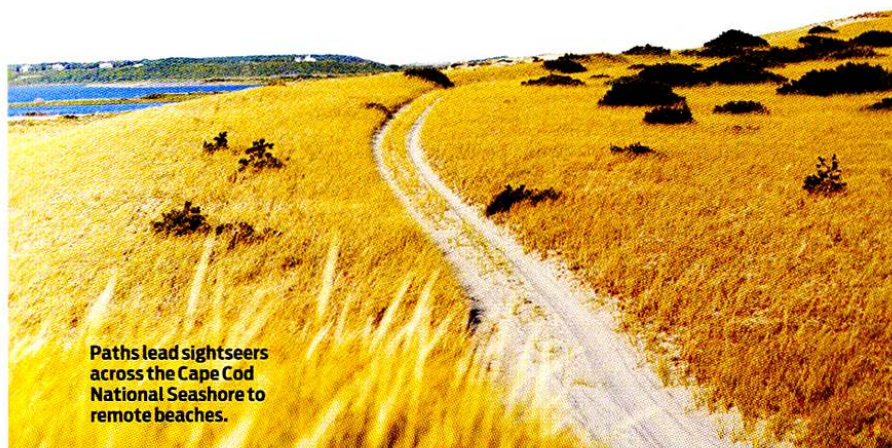
Paths lead sightseers across the Cape Cod National Seashore to remote beaches.