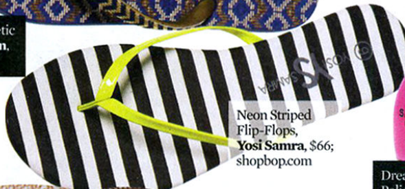
Neon Striped Flip-Flops, YOSI SAMRA , $66; shopbop.com