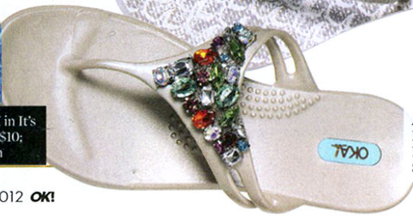
Alexandra Flip-Flops in Pearl, OKA b. , $40; oka-b.com