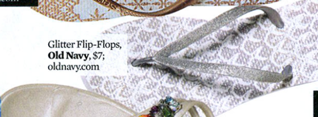
Glitter Flip-Flops, OLD NAVY , $7; oldnavy.com