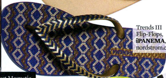
Trends III Flip-Flops, IPANEMA , $24; nordstrom.com