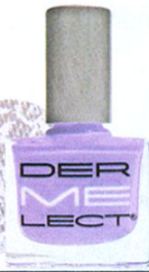
Nail Color Treatment in Luxurious, DERMELECT , $14; dermelect.com