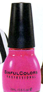
Dream On Nail Polish, SINFULCOLORS , $2; drugstores