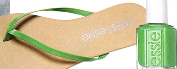
Mojito Madness Nail Polish, ESSIE , $8; essie.com