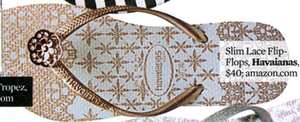
Slim Lace Flip-Flops, HAVAIANAS , $40; amazon.com