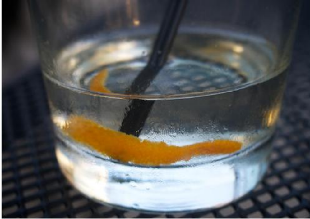
Area Four's very clean-tasting White Boy Manhattan: Bully Boy white whiskey, Cocchi Americano, and Regan's bitters.

While distribution's still limited to the greater Boston area, Bully Boy spirits are already integrated into cocktail menus at a number of Boston and Cambridge restaurants, including Area Four, Island Creek Oyster Bar, and L'Espalier.