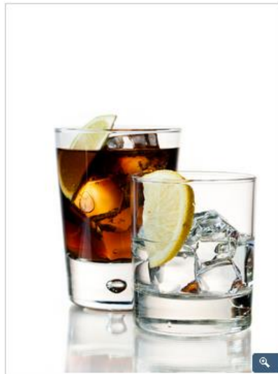
Cocktails

Our round-up for this week consists of some really fantastic spirits. In the brown spirits category we have Tap 357 Canadian Maple Rye Whisky and Bully Boy American Straight Whiskey, and in the vodka category we have HOPHEAD Vodka. Pick up one or all of these spirits and don't be shy about letting us know what you think. Cheers!