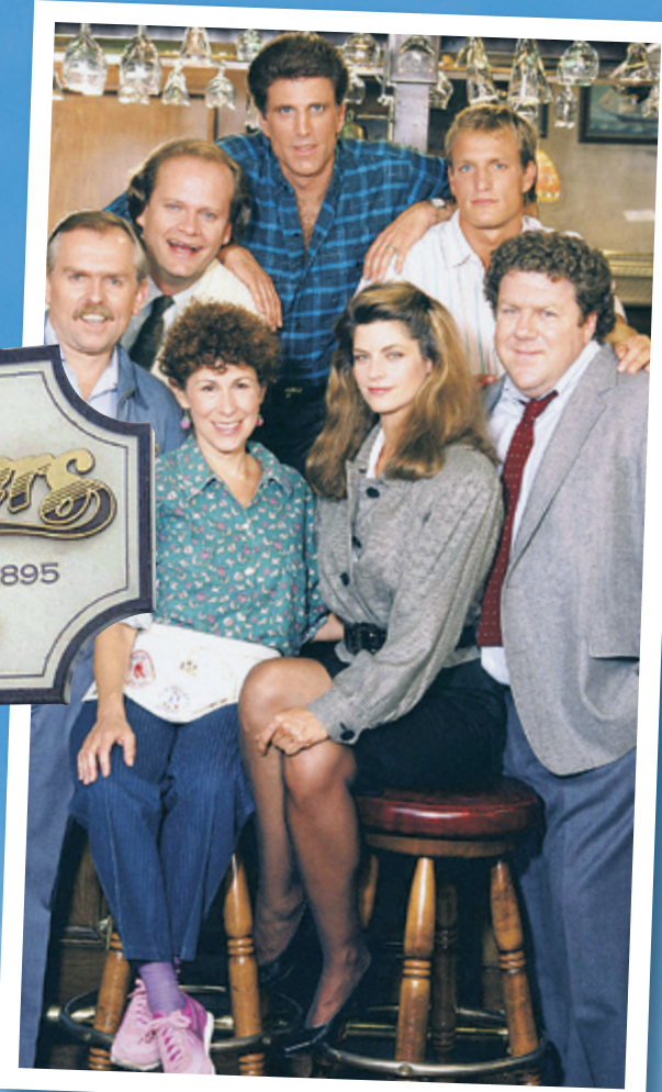
SHOW TIME: The cast of Cheers, above. Main pic, Joe's American Bar & Grill on Boston Harbour