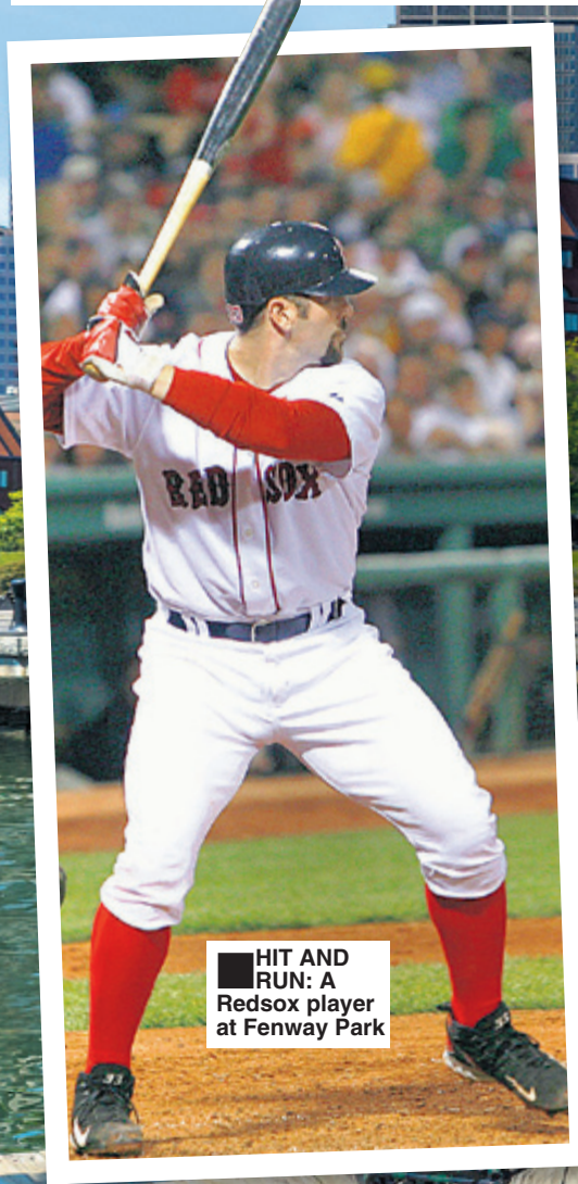
HIT AND RUN: A Redsox player at Fenway Park