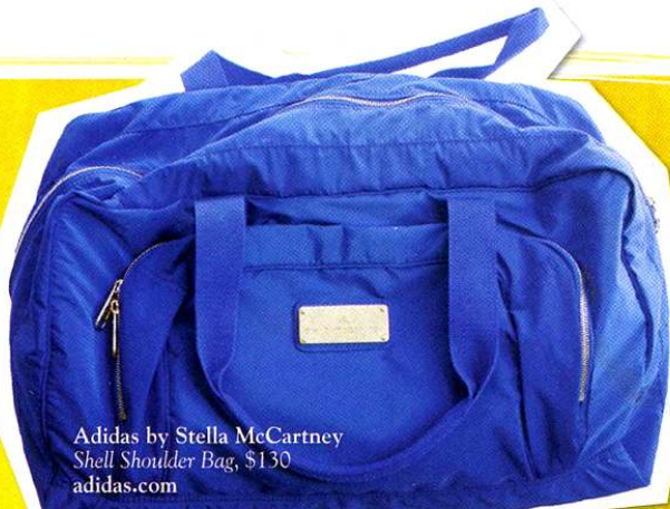
Adidas by Stella McCartney Shell Shoulder Bag, $130 adidas.com