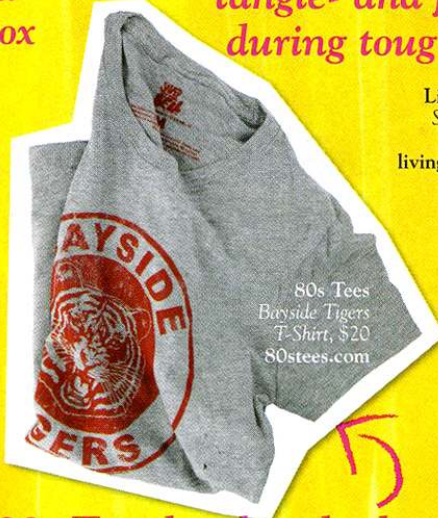
80s Tees Bayside Tigers T-Shirt, $20 80stees.com