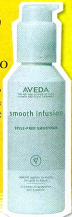
Aveda Smooth Infusion Style-Prep Smoother, $24 aveda.com

When you purchase a Spirit Hood with the PRO BLUE logo, 10% of net profits will be donated to a non-profit organization dedicated to helping that particular Spirit animal.