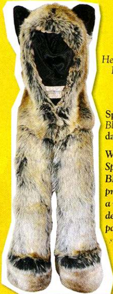
Spirit Hoods Black Wolf Navajo, $140 dailygrommet.com

When you purchase a Spirit Hood with the PRO BLUE logo, 10% of net profits will be donated to a non-profit organization dedicated to helping that particular Spirit animal.