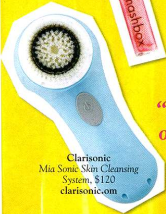
Clarisonic Mia Sonic Skin Cleansing System, $120 clarisonic.com

"80s Tees has hundreds of cool throwback shirts that make my runs more fun."