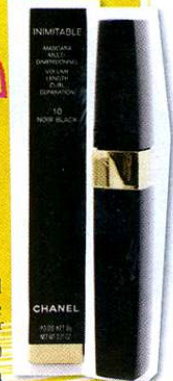
Chanel Inimitable Waterproof Mascara, $30 chanel.com

"I can go straight from work to playing soccer with no black streaks."