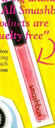
Smashbox Lip Enhancing Gloss, $18 each smashbox.com

"These keep my hair tangle- and frizz-free even during tough workouts."