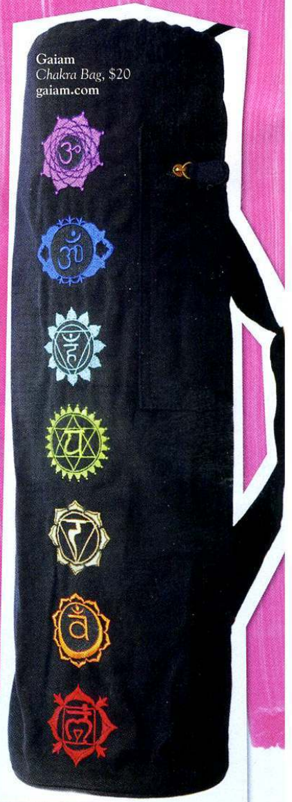
Gaiam Chakra Bag, $20 gaiam.com

“Now that my two kids are both (finally!) sleeping through the night, I love the idea of waking up to peaceful sounds in the morning.”