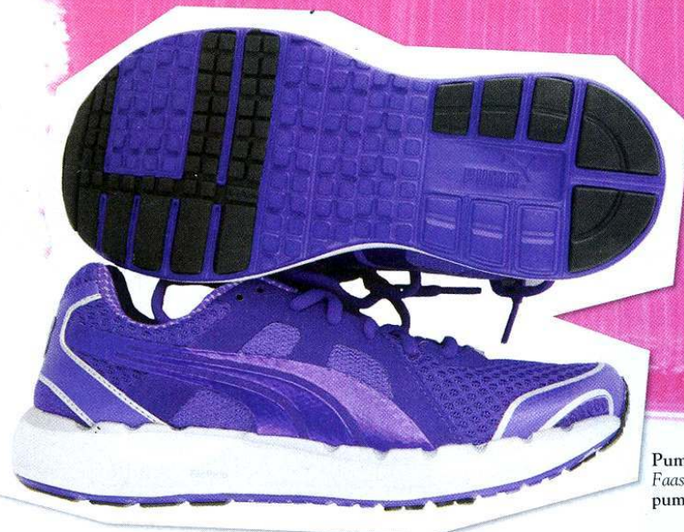
Puma Faas 550 Running Shoes, $90 puma.com

“Now that my two kids are both (finally!) sleeping through the night, I love the idea of waking up to peaceful sounds in the morning.”