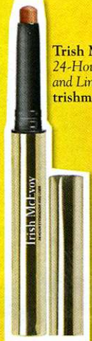
Trish McEvoy 24-Hour Eye Shadow and Liner, $32 trishmcevoy.com