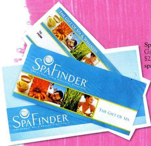
Spa Finder Gift Certificates, $25-$1,000 spafinder.com

Illustrations by Erin McGuire