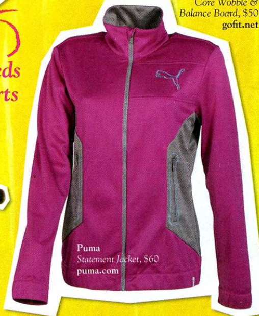
Puma Statement Jacket, $60 puma.com

"80s Tees has hundreds of cool throwback shirts that make my runs more fun."