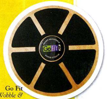
Go Fit Core Wobble & Balance Board, $50 gofit.net