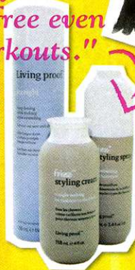
Living Proof Straight, $29 Frizz, $26 livingproof.com

"These keep my hair tangle- and frizz-free even during tough workouts."