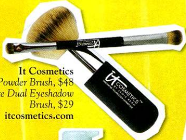
It Cosmetics Heavenly Luxe Powder Brush, $48 Heavenly Luxe Dual Eyeshadow Brush, $29 itcosmetics.com