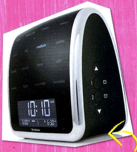
Brookstone Tranquil Moments Pro, $170 brookstone.com