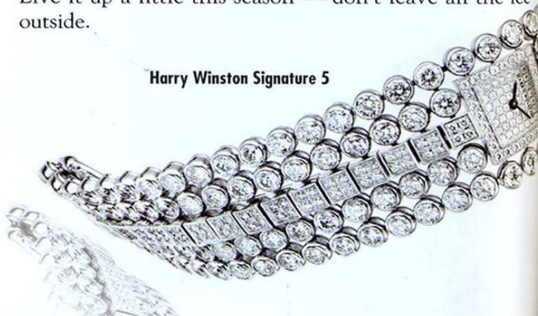
Harry Winston Signature 5

All of this mixes oh so nicely with Earth's favorite gemstone — the diamond. In fact, diamond jewelry and watches are all the rage this season as they reflect the icy beauty outside but none of the its chilly feel inside. Diamond-adorned watches run the gamut from simple rounds to florals, geometrics and some things in between. Live it up a little this season — don't leave all the ice outside.