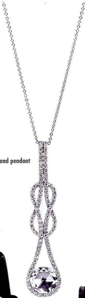
Martin Katz diamond pendant