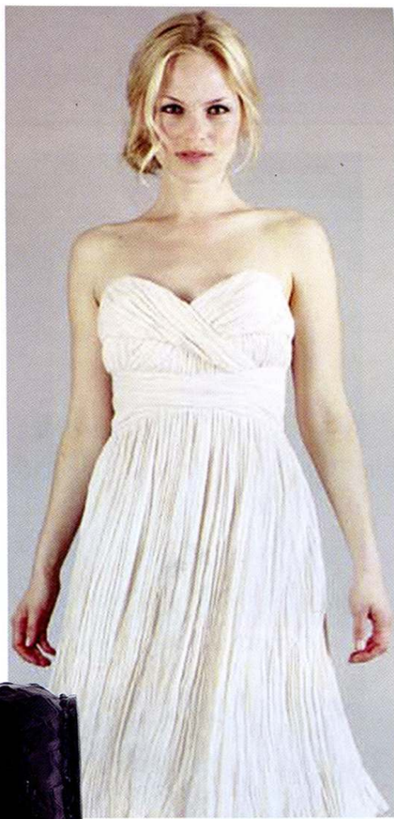
French Connection USA