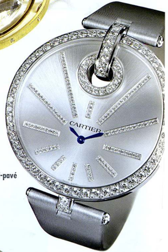
Cartier Captive XL semi-pavé