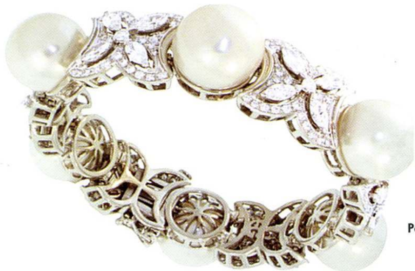
Pearl bracelet by Ellagem