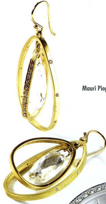
Mauri Pioppo Galileo earrings