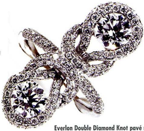
Everlon Double Diamond Knot pavé ring