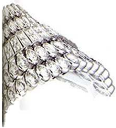
Bulgari High Jewelry