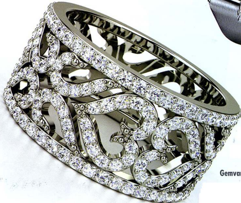
Gemvara Pal-Ete ring