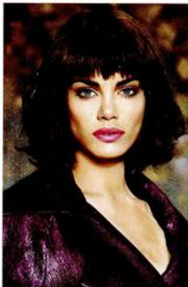
Try bangs to give your look instant excitement. They can even help your face shape look more proportional.