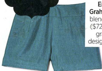
7 Emma Graham silk- blend shorts ($72; emma graham designs.com)