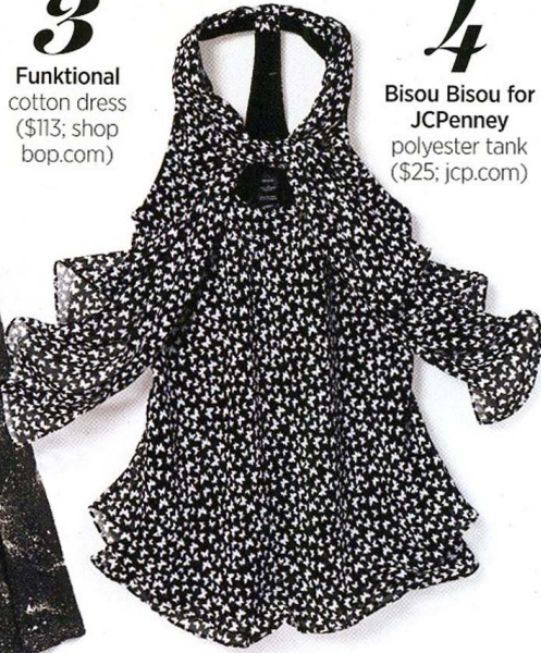
4 Bisou Bisou for JCPenney polyester tank ($25; jcp.com)