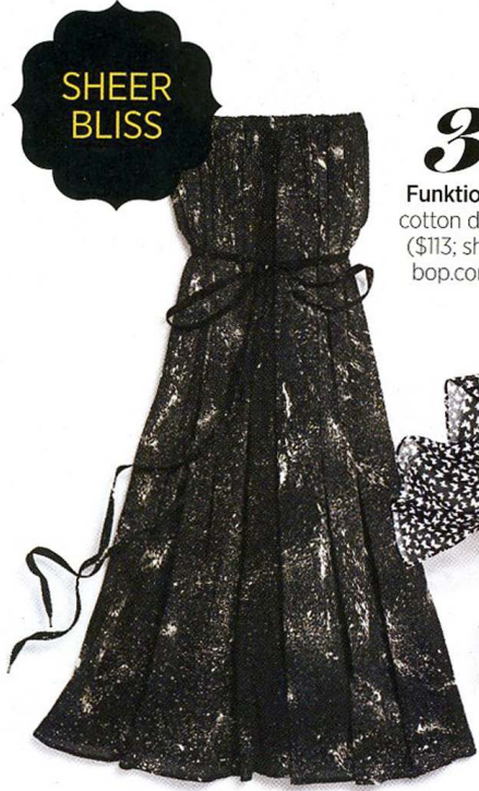
3 Funktional cotton dress ($113; shop bop.com)