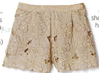
8 H&M cotton shorts ($35; hm.com)