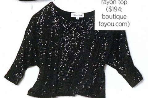
12 Fifteen-Twenty sequin and rayon top ($194; boutique toyou.com)