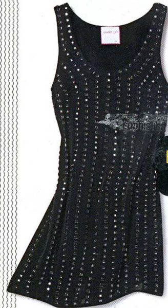
11 Fumblin' Foe silk dress ($187; fumblin foe.net)