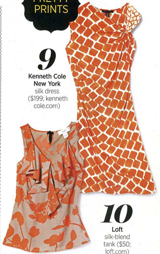
9 Kenneth Cole New York silk dress ($199; kenneth cole.com)