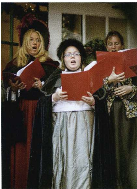
OPPOSITE, Nantucket's cobblestone Main Street is decked for the holidays. LEFT, carolers in period costume are a highlight of Christmas Stroll Weekend. TOP, a private residence gets into the spirit of the season.

But there's another Nantucket. Come fall and winter, it's a sleepy New England village. It belongs again to the locals, and to the hardy souls who love walking its windswept shores with no one in sight, who duck into its warm restaurants, where everyone seems to know everyone else. There's one special weekend in December, though, when the streets hum with visitors again. Officially it's the annual Christmas Stroll Weekend—though locals call it simply "Stroll." It began 37 years ago, and the idea hasn't changed since: Give people a reason to get together, to enjoy the island, to give a big boost to its shops and restaurants, and to celebrate a place that doesn't close up when the air turns cold—it simply relaxes, and in a way its people grow warmer. Stroll brings together people in a good mood, inspired in part by festive shops decorated with holly boughs and fanciful window displays.