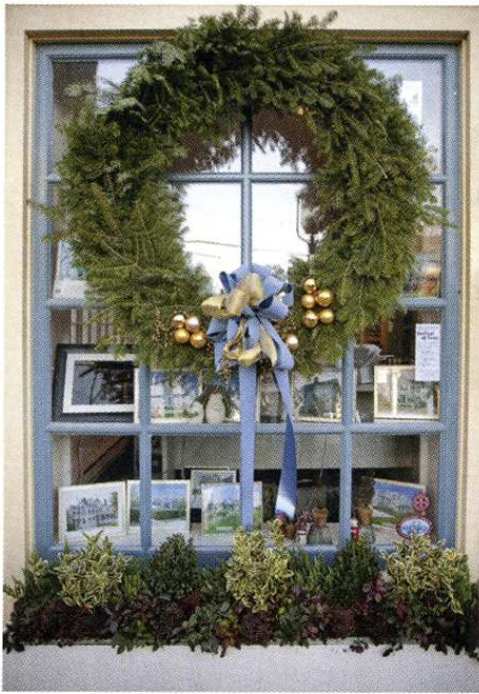
A wreath of fresh evergreens dresses the window of this downtown Nantucket storefront.

Wharf, the Nantucket Chamber of Commerce sponsors an event called “Chamber Food Fair,” as local professional chefs and home cooks offer hot provisions to chilled and weary shoppers.