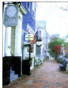
The island is full of quaint cobblestoned streets.

Hyannis is a six-hour drive from NYC. From there, one- and two-hour ferries are available (islandferry.com). Also, JetBlue flights