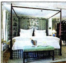
Each of Union Street Inn's rooms is uniquely decorated.

Looking for stars? Check out the Nantucket Film Festival (June 17-20, nantucketfilmfestival.org), which