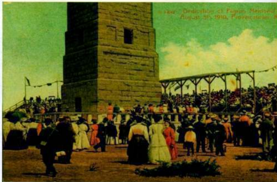
The stately 252-foot monument commemorates the 1620 landfall of America's Pilgrims and the signing of the Mayflower Compact in Provincetown Harbor.

Shop at our online store www.chathamsignshop.com