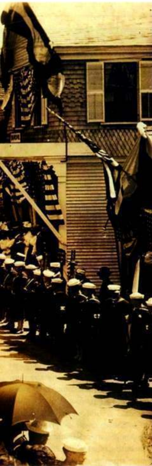
Festive crowds lined streets draped in patriotic regalia at Provincetown's impressive Pilgrim Monument dedication ceremony 100 years ago. President Taft and his wife, Helen, above right, attended the August 5, 1910 event.