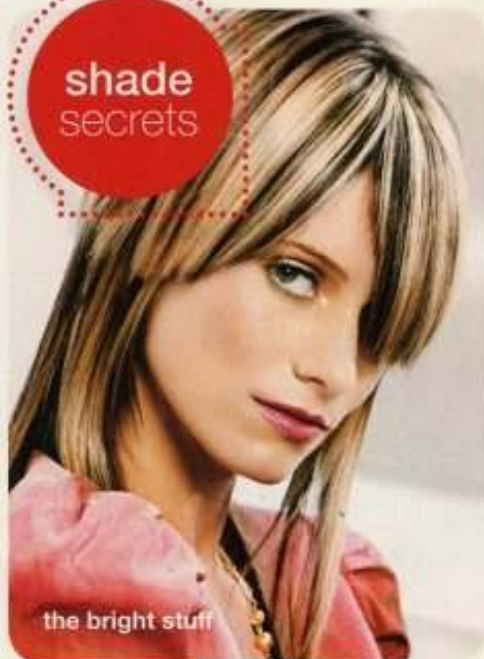
the bright stuff