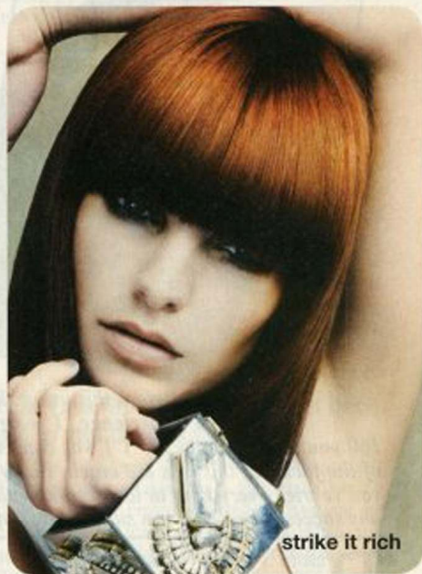
strike it rich