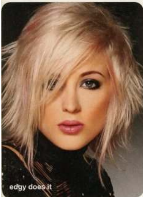
edgy does it