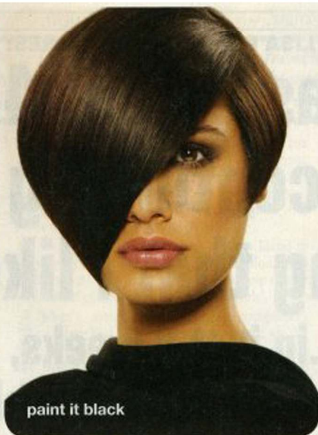
paint it black

HAIR BY XENA PARSONS, XENA'S BEAUTY COMPANY, NEW YORK, NY. MAKEUP BY BETTY MEKONNEN. PRODUCTION: GLOBAL HAIR & FASHION GROUP.