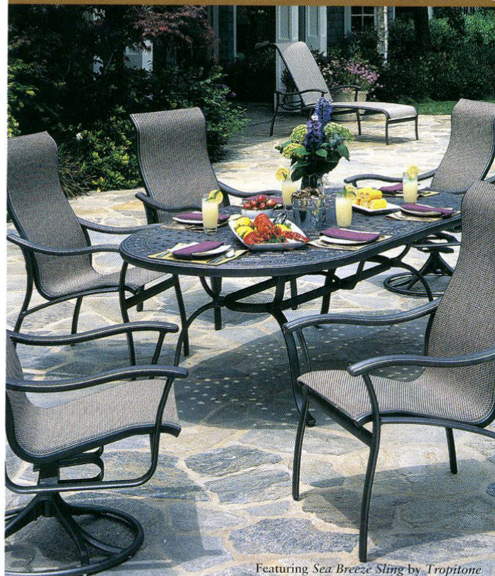
Featuring Sea Breeze Sling by Tropitone

All Tropitone Outdoor Furniture 15% Off Our Already Discounted Prices