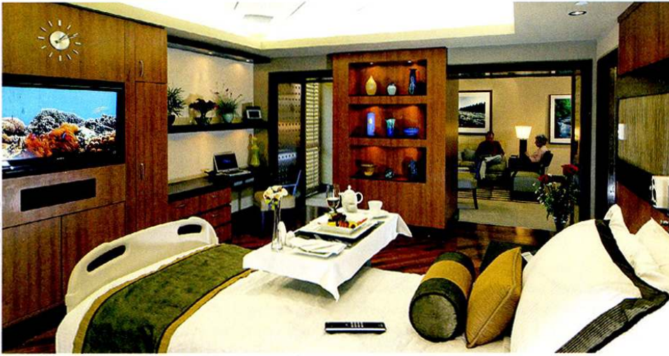
Renker Pavilion makes comfort a priority for families visiting Eisenhower Medical Center.