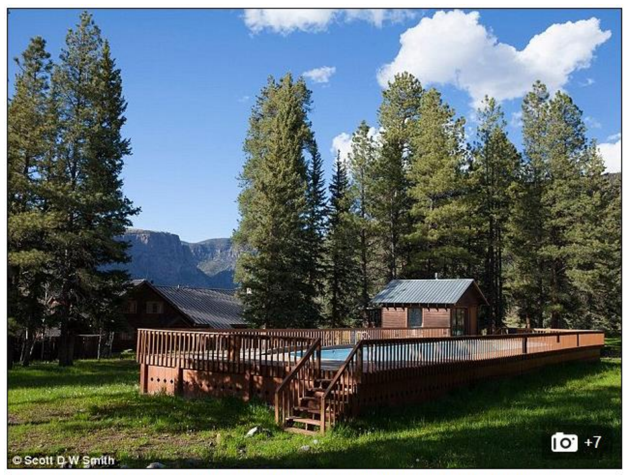
First: CannaCamp is the first marijuana-devoted resort in the state, which legalized the drug last year

'Enjoy a mellow high, and a greater focus on breathing in the crisp mountain air. Namaste.'