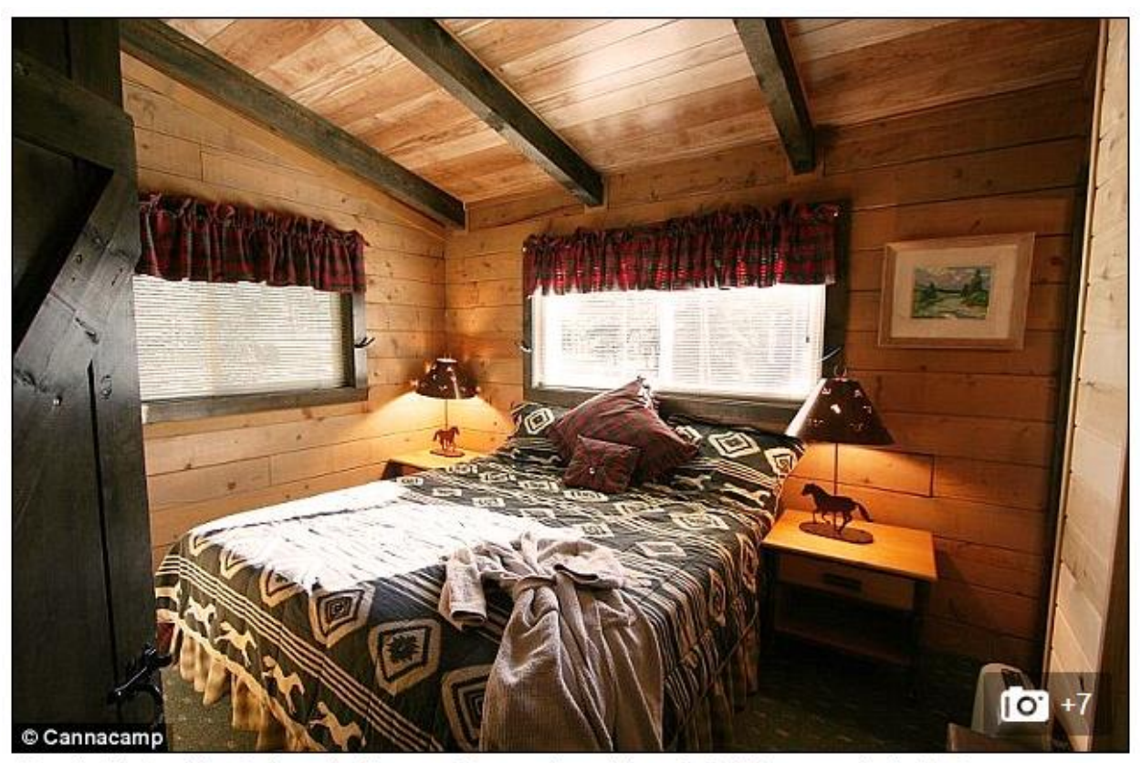
Homely: Pictured is a bedroom inside one of the wooden cabins, of which there are nine in total

Guests will also be taught the art of cooking their own cannabis-infused food, as well as having access to more general instruction on using the drug.