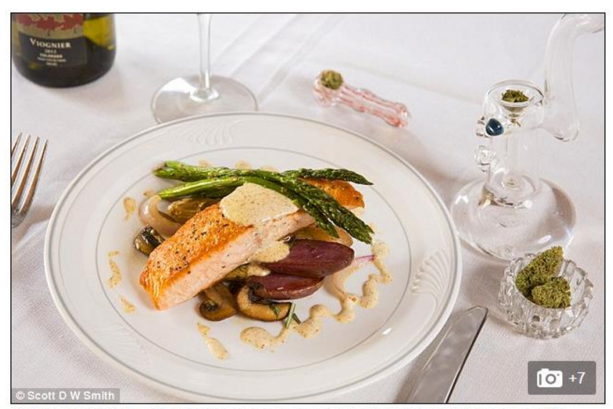
Potted salmon: Guests will be offered bespoke cannabis pairings with their meals and wine, such as this broiled salmon with asparagus and mushrooms

Due to the particulars of Colorado law, CannaCamp isn't allowed to include marijuana in its all-inclusive package of food, accommodation and activities, which start at $395 per person per night.