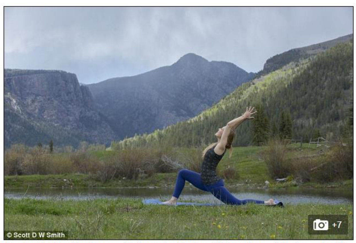
Deep breaths: One of the classes on offer for guests will be Cannabis Yoga, where participants exercise while high