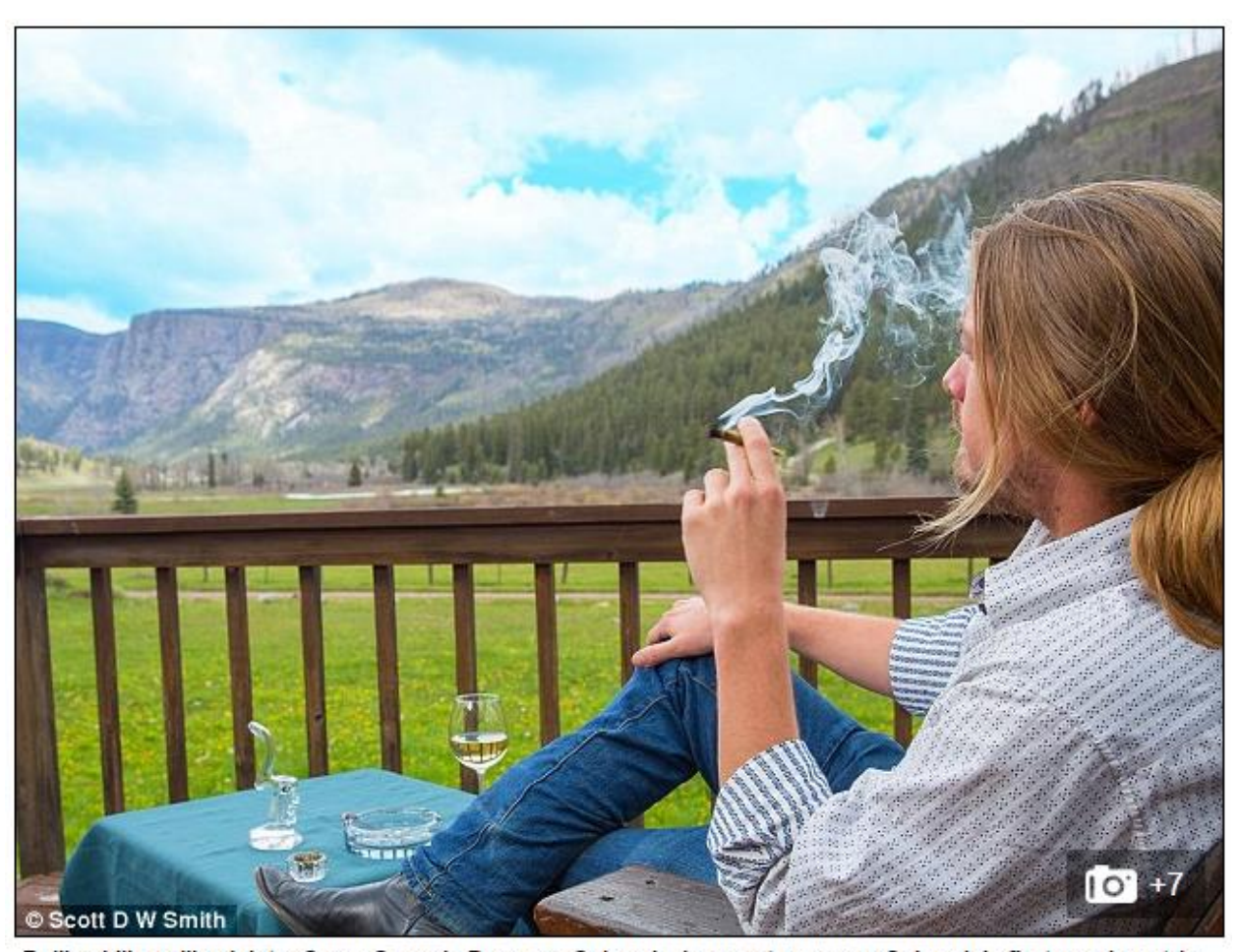
Rolling hills, rolling joints: CannaCamp in Duragno, Colorado, is soon to open as Colorado's first weed-centric vacation resort