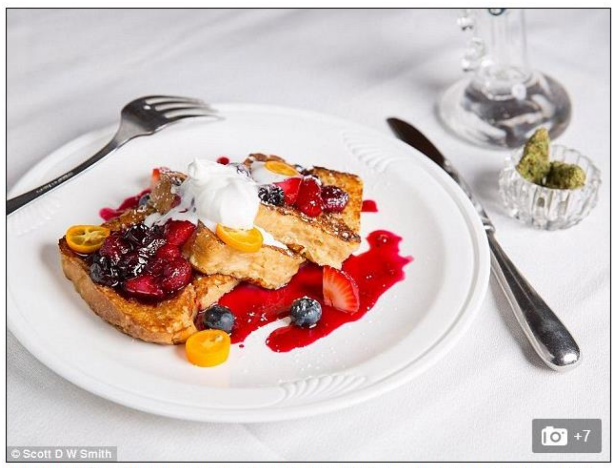
Baked breakfast: Guests will have access to a 'cannabis concierge' while at the resort - which is not allowed by Colorado law to include the actual supply of the drug in its all-inclusive billing