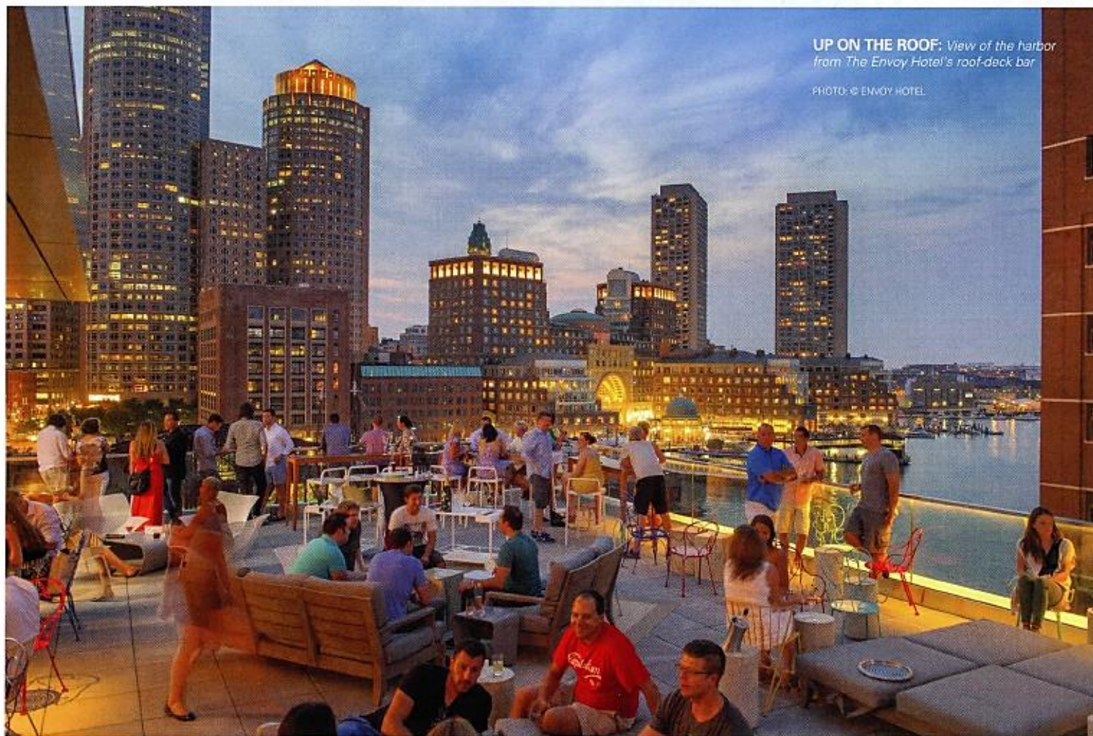
UP ON THE ROOF: View of the harbor from The Envoy Hotel's roof-deck bar