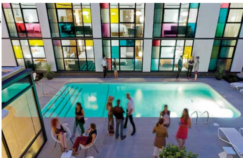
The outdoor pool at The Verb Hotel, a 94-room, retro-hip hotspot in the heart of Fenway.

When you're ready to go back to the future, return to the Fenway neighborhood for dinner at Hojoko , The Verb Hotel's lively Japanese restaurant. It offers a different nostalgic stripe: Boston's old-school rock scene. The vibe is Japanese kitsch meets punk, and the food is