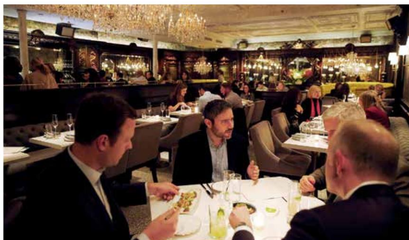
Yvonne's is the place for nouveau Middle Eastern cuisine and Boston's Ward 8 cocktail.

Federal Wine & Spirits 29 State St.; 617-367-8605; federalwine.com ; nearest MBTA: State Street