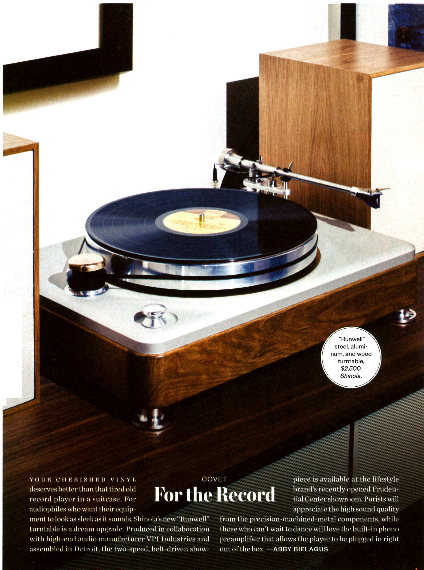
"Runwell" steel, aluminum, and wood turntable, $2,500, Shinola.

YOUR CHERISHED VINYL deserves better than that tired old record player in a suitcase. For audiophiles who want their equipment to look as sleek as it sounds, Shinola's new "Runwell" turntable is a dream upgrade. Produced in collaboration with high-end audio manufacturer VPI Industries and assembled in Detroit, the two-speed, belt-driven show-