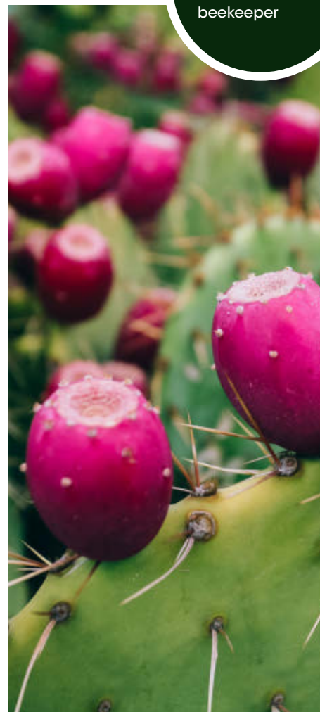
left: Cattails top: Prickly pears