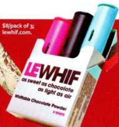
$8/pack of 3; lewhif.com.

Pick up color strips from a hardware store in hues that work with your décor, says Stark. Use white stickers to personalize with guests' names. Place on a plate or tuck into an artfully folded napkin. Admire your table!