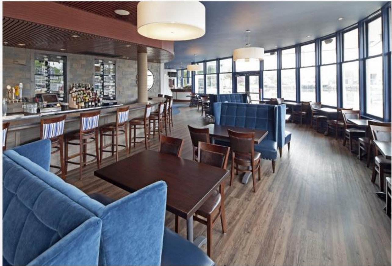
Interior shot of David's

The three-minute trudge through swirling snowflakes was just long enough for a laugh before battenning down in the window-lined riverside dining room that bustled with cocktailing couples (younger, compared to some of the other restaurants) for the standout meal of the weekend. The New England-inspired fare included a tender filet mignon with a perfect cauliflower-parmesan mash, skewers of citrus- and truffle-inflected shrimp and scallops, and plenty of fresh oysters from the raw bar. Outside the window, inches accumulated on a docked ship; it looked like something phantom Arctic pirates might hijack. But inside we were warm, rosy from wine and five years of Valentine's Days. We hadn't been counting on this interfering snowstorm, but in a world of constant digital connection – buzzing phones, rapidly refilling email inboxes – we were suddenly grateful for Mother Nature imposing upon us a moment to stop, slow down, and appreciate what was right in front of us. The timing was just right, and I found myself in love with Kennebunkport in a whole new way.