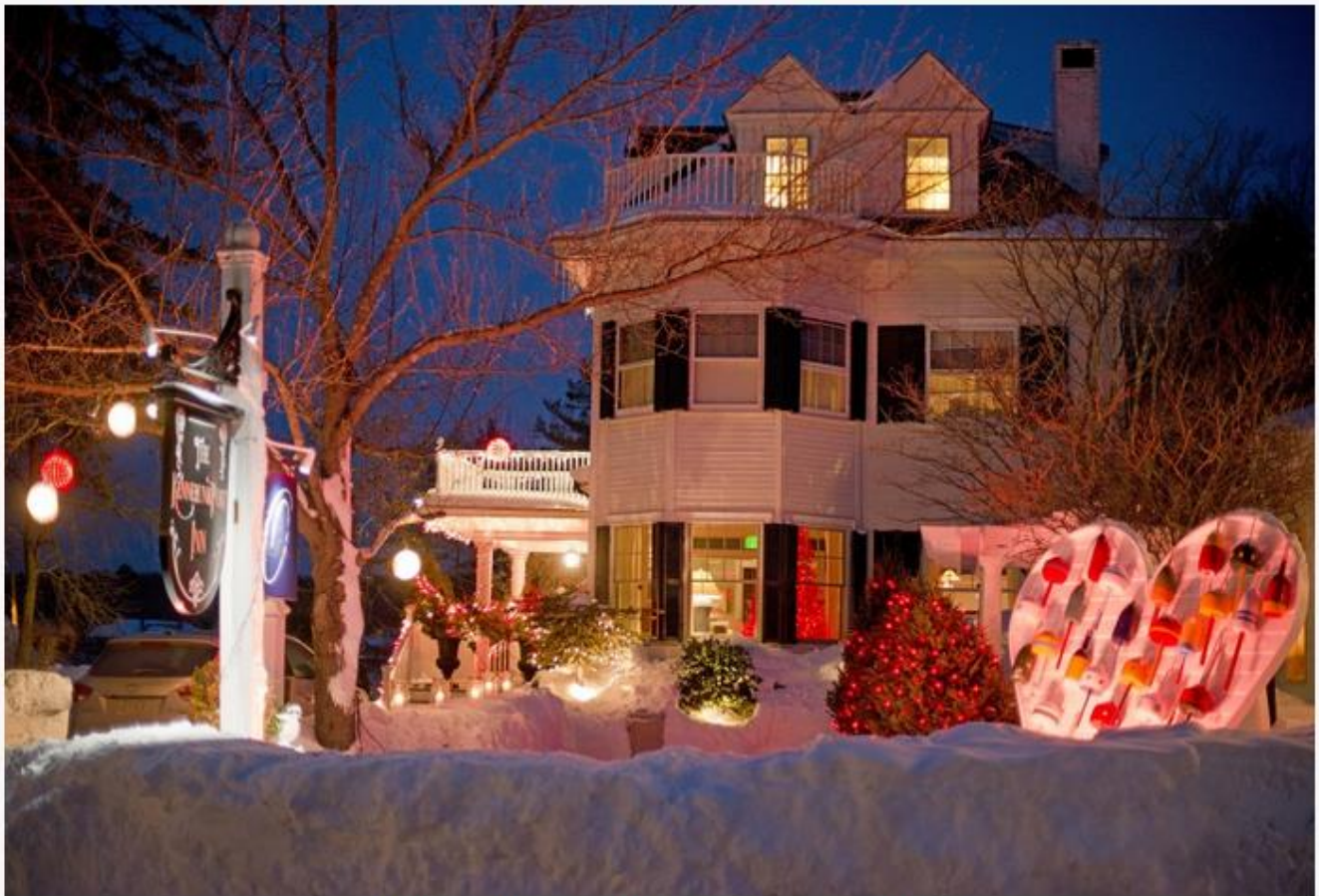
Paint the Town Red – Kennebunkport Inn Kennebunkport, Maine