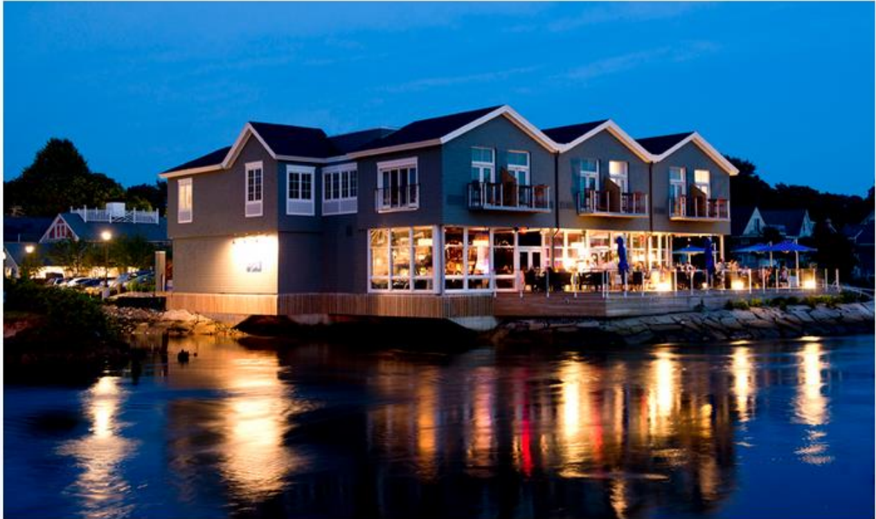
An exterior shot of David's — from the summer of course.

Visit DestinationKennebunkport.com to check out winter packages and special rates. Try to make it up for the “Valentine’s Do-Over” weekend on March 13-14, which also coincides with Maine Restaurant Week.