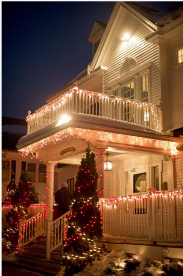
Front view of the Paint the Town Red Inn

Like most native New Englanders, I suspect, I've always enjoyed visiting Kennebunkport in the summer. (Warm days and fresh lobster on the Maine coast — how can you not swoon?) But as anyone in a relationship can tell you, it's during life's little storms — not under its fair skies — when love really reveals itself. Kennebunkport was walloped with a winter storm this Valentine's Day, while me and my other-half were celebrating with an off-season weekend getaway. It could have been a disaster — but as fate would have it, it was just what we needed: a reason to slow down and soak in the sweet charm of a quintessential New England resort town. The place has a lot of heart.