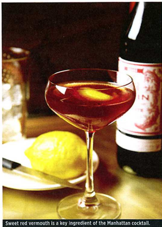
Sweet red vermouth is a key ingredient of the Manhattan cocktail.