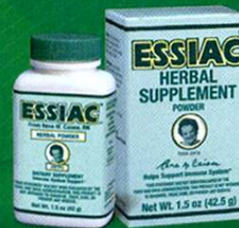
ESSIAC Powder Formula NPN 80012920