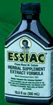
ESSIAC Extract NPN 80012914