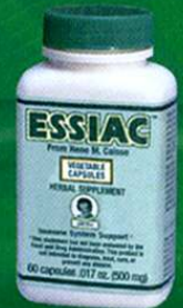
ESSIAC Vegetable Capsules NPN 80015598