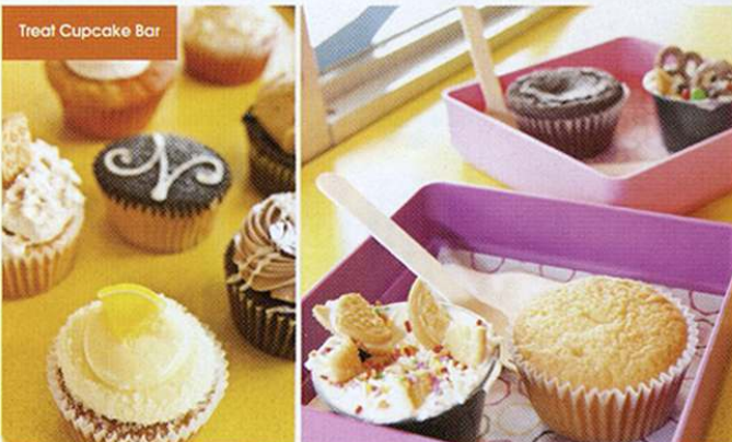
Treat Cupcake Bar