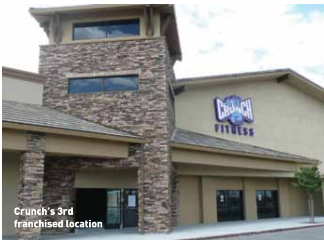
Crunch's 3rd franchised location

Last month, Crunch Fitness, the club brand known for its "No Judgments" philosophy, opened a 17,000-square-foot facility in the Blue Oaks Shopping Center in Rocklin, California, making it the company's third franchised location, nationwide. The new club will feature Crunch's high-end equipment, expert personal training, online fitness and nutrition programming, free tanning, and its signature group-exercise classes.