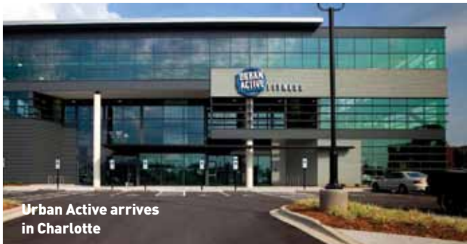
Urban Active arrives in Charlotte

Urban Active Fitness, a rapidly growing chain of full-service fitness centers, recently opened its 42,000-square-foot Ballantyne club in Charlotte, North Carolina, its first in that state. The new $13-million, three-story fitness facility features an indoor swimming pool, elevated running track, racquetball courts, supervised children's play area, and more than 115 pieces of cardiovascular and strength-training equipment.