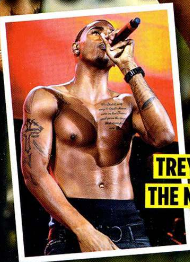
TREY SONGZ: THE NAKED TRUTH

Featuring BEYONCÉ, ROMEO, HALLE, SERENA, POOCH HALL & MORE!