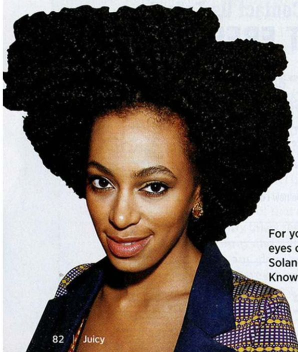
For your eyes only: Solange Knowles