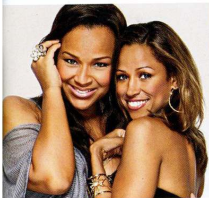
SINGLE IN THE CITY STACEY DASH & LISARAYE