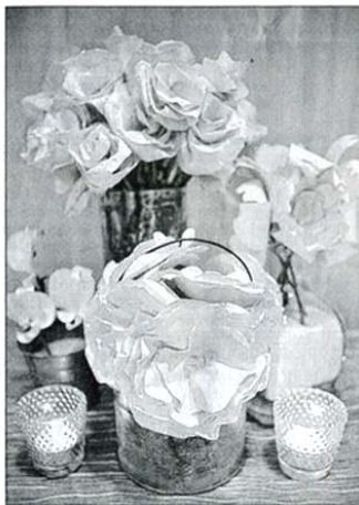
Paper flowers can be made to decorate the head table at your wedding reception. Prices start at $150 at papergownsandglory.com .