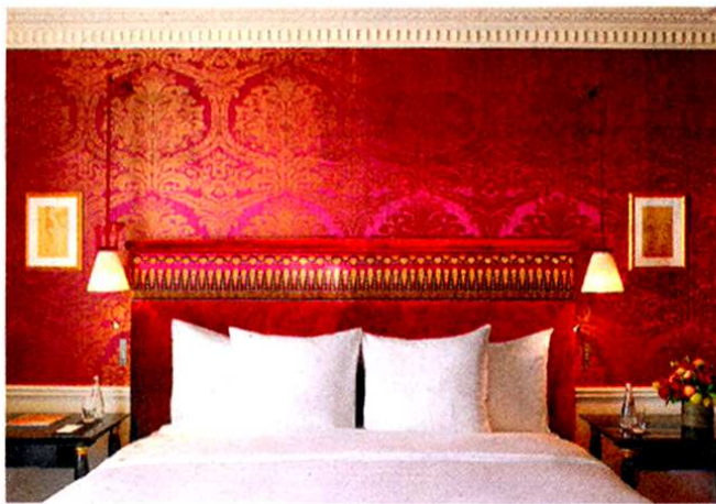
LA RESERVE PARIS HOTEL AND SPA

Opened in January on quiet Avenue Gabriel, between the fashionable Faubourg Saint-Honoré and the Champs-Élysées, down the street from the Élysée Palace gardens, the new La Réserve Paris Hotel and Spa conjures turn-of-the-20th-century elegance in a period home once owned by Pierre Cardin. The designer Jacques Garcia oversaw the renovation, which features silk on the walls, velvet drapes and parquet floors in its 40 rooms, partly furnished in antiques. Amenities include an indoor swimming pool, three-treatment-room spa, orange garden and upscale French restaurant. Rooms from €750, including breakfast; lareserve-paris.com.