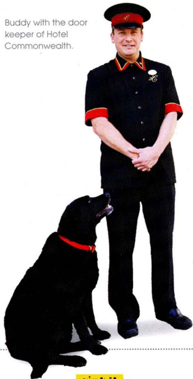
Buddy with the door keeper of Hotel Commonwealth.