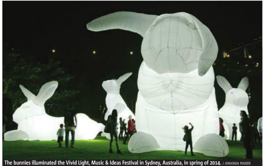
The bunnies illuminated the Vivid Light, Music & Ideas Festival in Sydney, Australia, in spring of 2014.

The installation is part of the D Street ArtLAB's "Won-