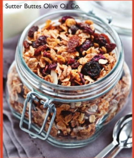
Sutter Buttes Olive Oil Co.