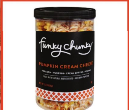
Funky Chunky, Inc.