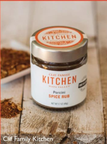
Cliff Family Kitchen