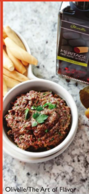
Olivelle/The Art of Flavor